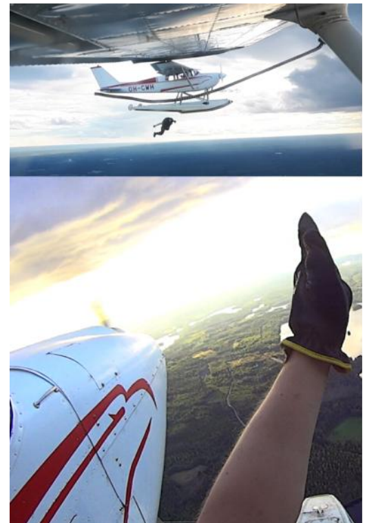
Some jump from electric planes, some from tradional planes, others from seaplanes

Pages 68 to 74 of 222 pages are covering NCO operations.