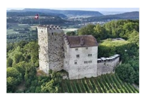
The Habsburg Castle