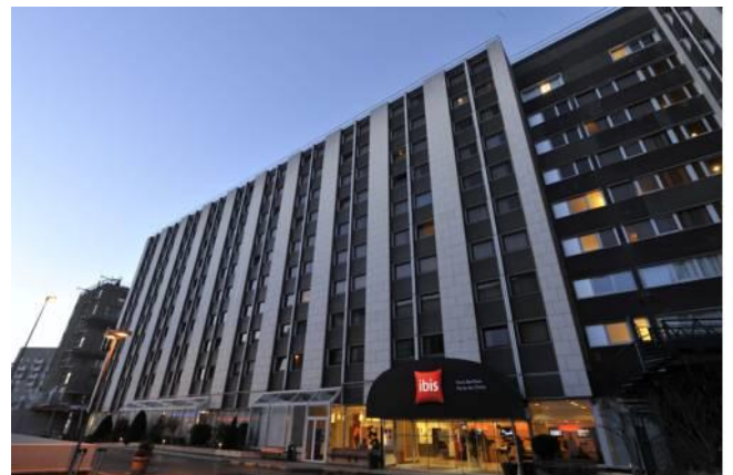
Our hotel, Paris Ibis Clichy-Batignolles

EPFU Members EPFU Board Members EPFU Friends