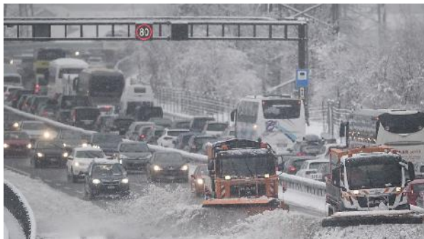
St. Gotthard Motorway A2, 31 March 2018