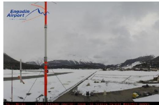
Samedan Engadin Airport, 31 March 2018

You will agree: The word is waiting for the sunrise, most probably patience the key-word for some areas.